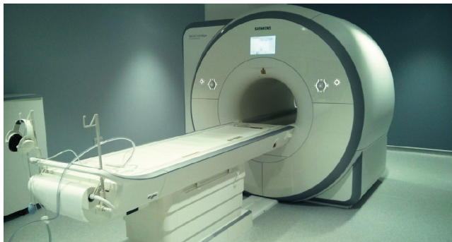
Image of an MRI scanner