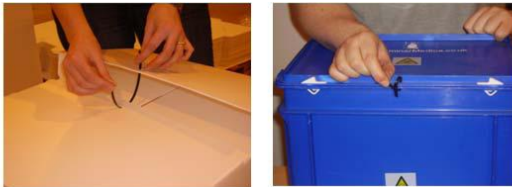
Figure 9: Sealing the transport boxes