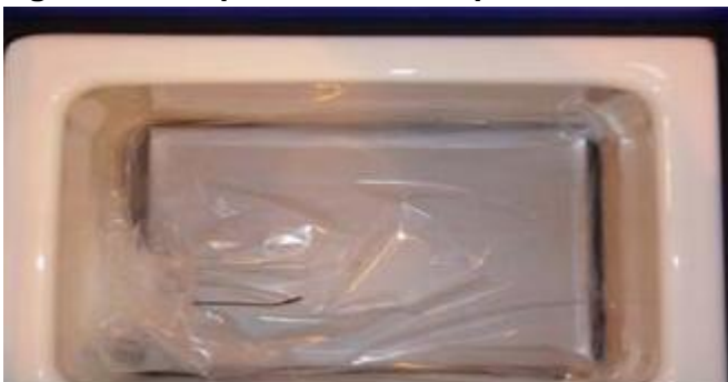
Figure 8: Mediporter with cool pack

6.7: The polystyrene lid is placed on top of the box. The lid of the plastic outer box is closed. Every Tuesday place a datalogger is placed in both the large transport box and the Mediporter (section 8)