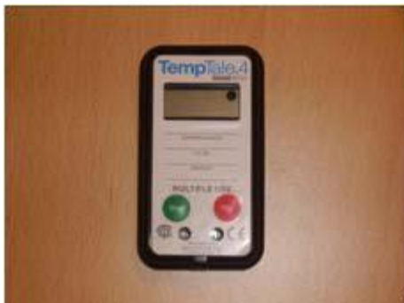
Figure 10 Temptale 4

8.2: The co-ordinating centre configures the dataloggers to automatically begin recording, this is done before they are sent out to the assessment centre. Therefore the assessment centre does not need to press the start button. A symbol of a sun will be present on the datalogger screen to indicate it is set to automatically begin recording (figure 11).