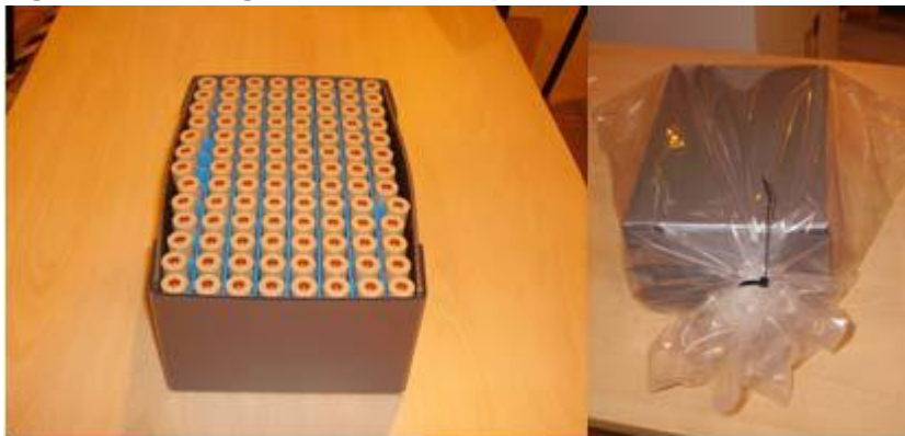
Figure 5: Sealing racks for transport

6.4: On the two short sides of the transport box are placed a cool pack and a spacer (see figure 6). The cool packs are kept in the freezer for at least 24 hours before use and are taken out 30 minutes before being used each day.