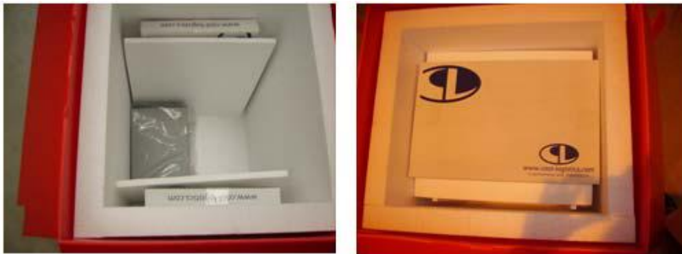
Figure 7: Racks in Mediporter

6.6: A third spacer is placed on top once the sample racks are all loaded and the third cool pack is placed on top of the spacer (figure 8).