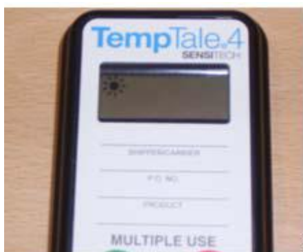
Fig 11 Temptale 4 set to record

8.3: The datalogger is placed on top of the rack within the plastic bag, with this rack at the top of the large transport boxes or mediporter. This will stop the datalogger being inadvertently switched off in transit.