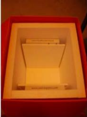
Figure 6: Mediporter transport box with cool packs

6.5: The bagged racks are placed into the large transport box (figure 7).