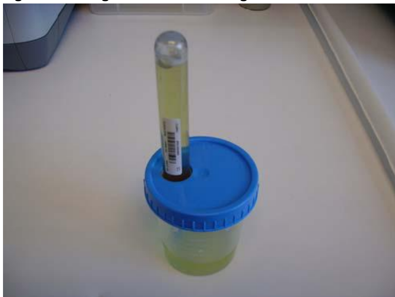
Figure 3: Filling the urine collecting tube

5.3: The urine tube is scanned and transferred to the refrigerator immediately. It is placed in the next available position in the corresponding sample rack in the fridge.